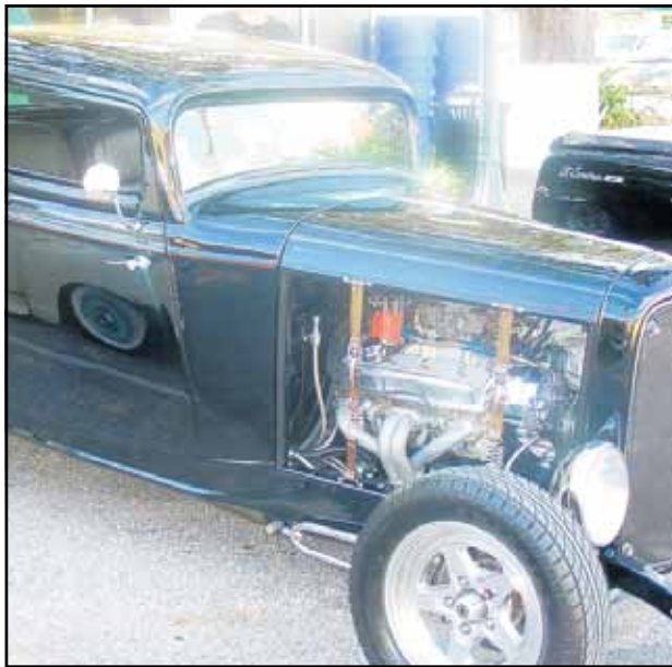
Black is beautiful in the eyes of the owner of this 1930s Ford hot rod powered by a modern V-8 engine.