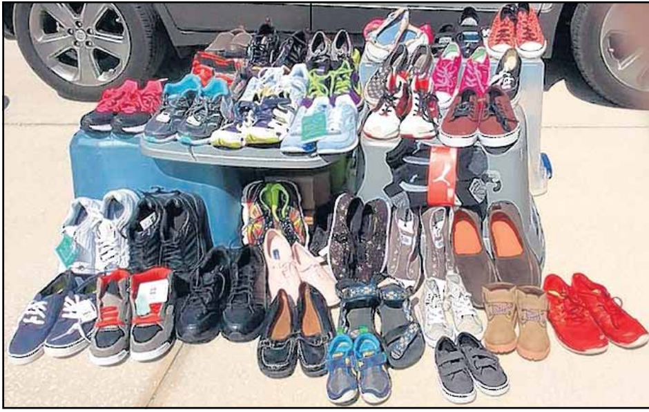
While all kinds of shoes are welcome, Shoes 4 Schools primarily focuses on collecting athletic shoes for needy students in Pasco County.