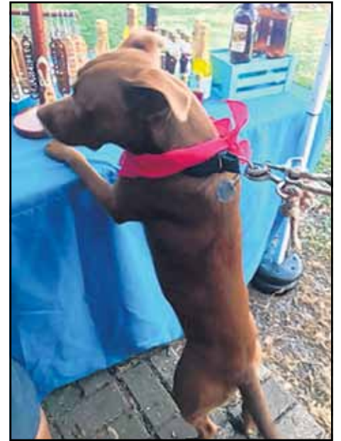
Many well-behaved pets visited the Pasco Pet Fest this year, including two pigs, a lemur and a lizard.

Proceeds from this year's event were donated to Florida Skunk Rescue, Inc., a local nonprofit domestic skunk rescue and education group. Visit www.floridaskunkrescue.com to learn more.