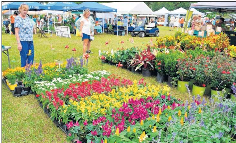
Shoppers were able to select from dozens of vendors to find the perfect additions for their gardens at Saturday's horticulture festival.