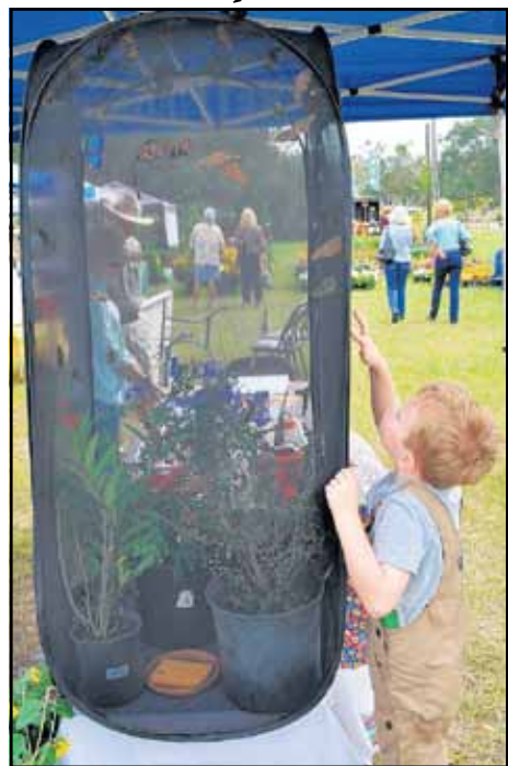
Children were infatuated by a net containing dozens of butterflies. Some of the butterflies are rare finds while others are commonly seen in Pasco County.

San Antonio City Park was buzzing Saturday as county locals flocked to a gardening haven created by the Pasco County Master Gardeners.