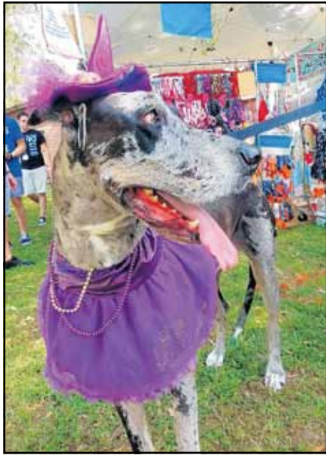
A Great Dane had a fun time playing dress up during this year's pet extravaganza.