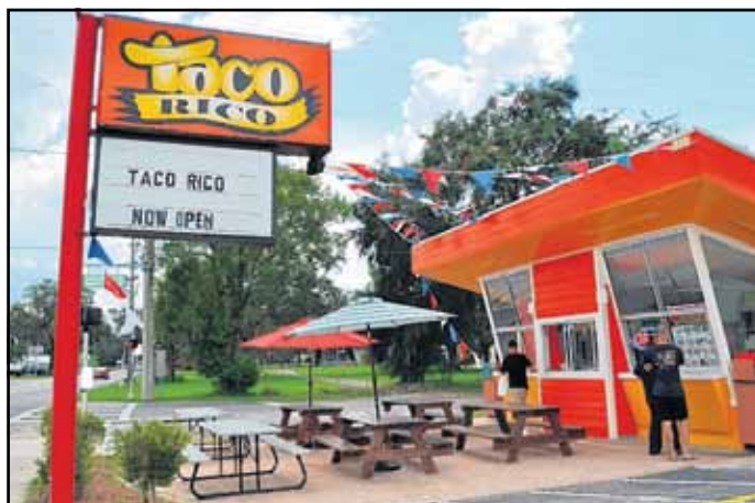
After gaining popularity in several other Pasco locations, Mexican restaurant Taco Rico has officially opened a brick and mortar location in Zephyrhills.

Authentic Mexican Eatery Has Loyal Following