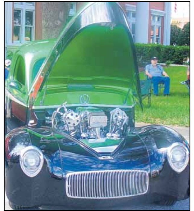
A custom paint job and grille helped separate this 1940s street rod from many of the others exhibited during Saturday's car show downtown.