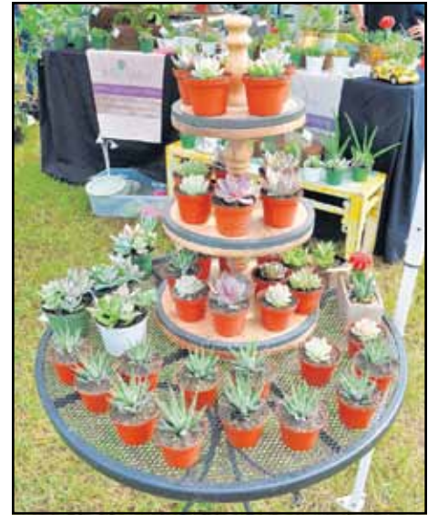
A tower of succulent plants for sale from a commercial vendor at the inaugural Gardening 365 event held in San Antonio last weekend.

coordinating a pick up area to easily load the new greenery into vehicles.