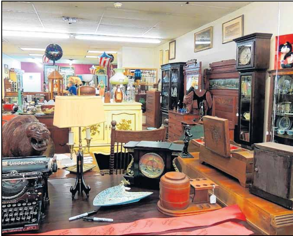
K & M Treasures and Antiques offers everything from jewelry, furniture and other knick-knacks, and specializes in collecting Disney memorabilia.