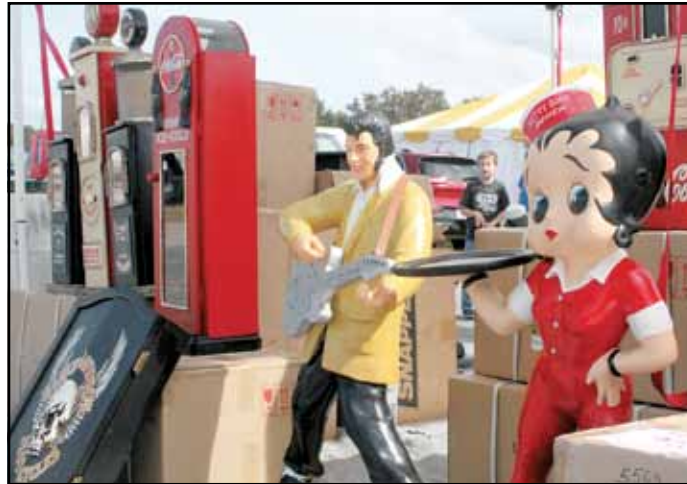
Gas station memorabilia was everywhere at the swap meet area of last year's auto event.

This Year's Light 'Em Up Zephyrhills Scrubbed Due To Road Construction