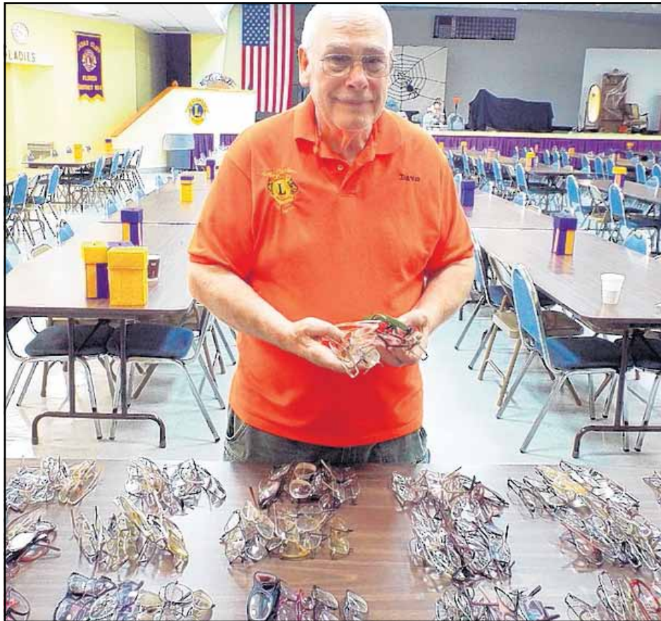
A Zephyrhills Lions Club member sorts through dozens of glasses donated by local residents. The glasses will be refurbished and distributed to others who may not be able to afford the expensive frames and/or lenses.

Applicants must provide required documents, which can be found at www.e-clubhouse.org/sites/zephyrhills ,