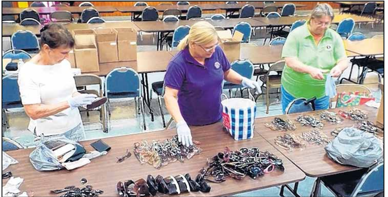
Hundreds of glasses, whether prescription, reading or sunglasses, are donated at the multiple drop boxes stationed at different eye clinics and business in Zephyrhills and Dade City to go toward the Zephyrhills Lions Club's Sight Program.

"[The Bingo players] are so generous with their donations. Without them this wouldn't be possible,"