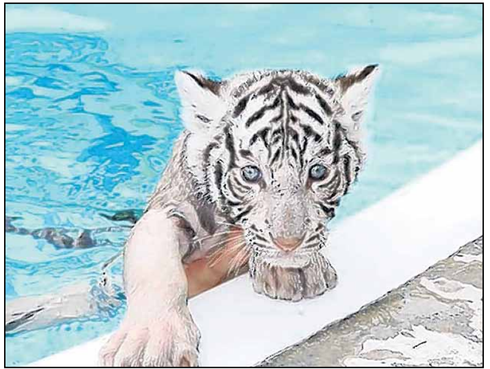
PETA's initial complaint, backed by alleged eyewitness accounts of abuse and neglect, and previous federal violations, centers around the zoo's programs allowing patrons to handle, pet and swim with tiger cubs.

Joe Maldonado of Greater Wynnewood Exotic Animal Park in Wynnewood, Okla., acknowledged 19 tigers arrived at his facility on July 16. He said he didn't know what had happened to the other