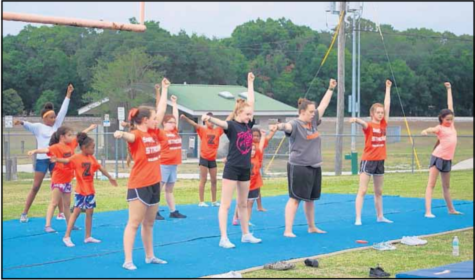
Cheerleaders learned new moves and routines during the ZAL Football and Cheer Camp at Krusen Filed last weekend.