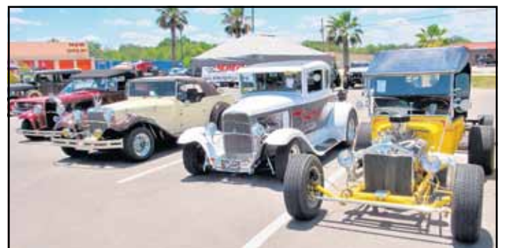
More than 100 participants took part in a May 7 car, truck and bike show to raise money for two local families who lost their homes to a fire last month.