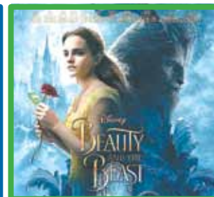
Beauty and the Beast PG – 10:55 PM