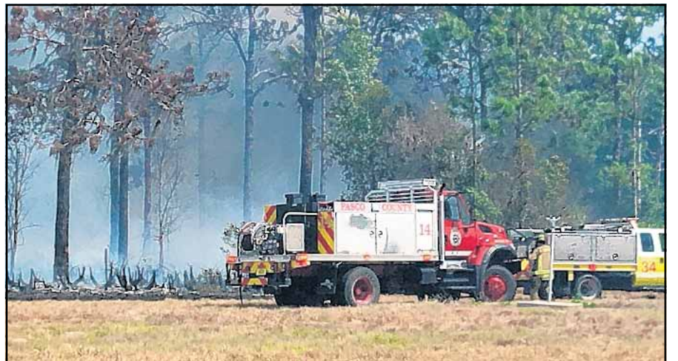
The larger illegal fires have been reported on the west side of the county and despite Tuesday's rain, the county remains dry.