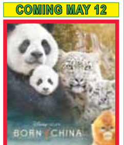
COMING MAY 12