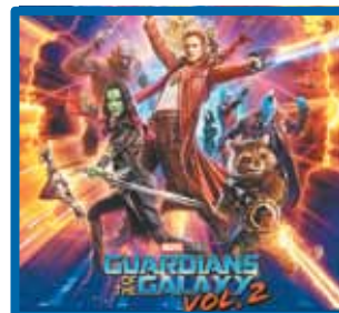
Guardians of the Galaxy: Vol 2 PG-13 – 8:30 PM