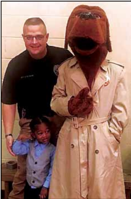
Representatives from the Pasco County Sheriff's Office were a popular visit for children attending the local YMCA's latest event.

Kids and families were inspired to keep their minds and bodies active all summer at the East Pasco Family YMCA's free Healthy Kids Day event on April 29. Healthy Kids Day is the Y's national push to improve families' health and well-being. Children enjoyed camp games, bounce houses and healthy snacks while learning more about summer camp, swim lessons and youth sports. Community partners gave out freebies, including backpacks from Publix and books from the Pasco County Library to help encourage education and reading throughout the summer. The Pasco County Sheriff's Office provided free fingerprinting, Zephyrhills Fire Rescue offered fire truck tours and Zephyrhills Police showcased their K-9 unit, which reportedly stole the show. Healthy treats were also provided by Publix, Nutri-Truck and Kona Ice. Other partners who helped make the day a success, including LuLaRoe, Bricks 4 Kidz, Great Clips, Young Living Essential Oils, Origami Owl, Family-Friendly Tampa Bay and Chat & Chalk.