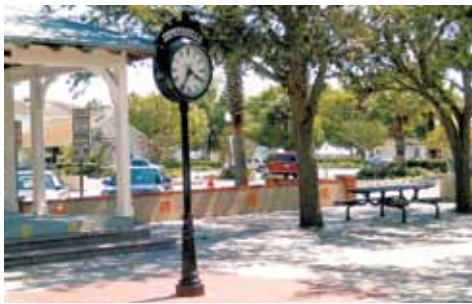
Main Street Zephyrhills