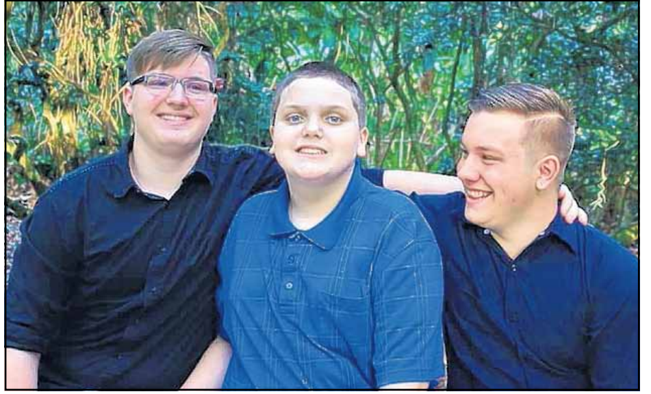
The three Weatherington children and their parents lost everything when their homes burned in a fire last month. They are hoping to bounce back with the help of a May 7 car, truck and bike show put on by the community.