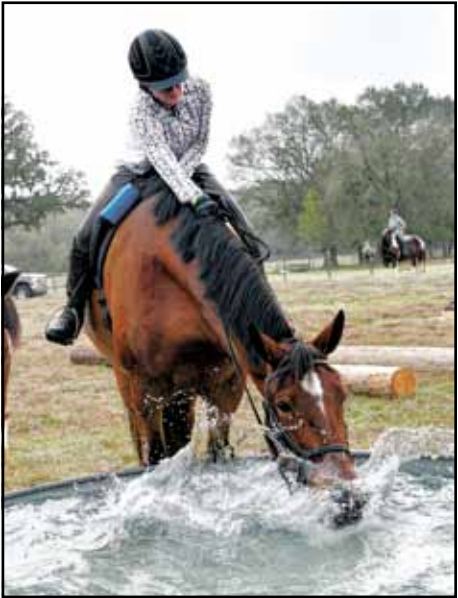
Halfway through the ride horses were able to stop for a water break. Some even had fun with the down time and blew bubbles in the trough.