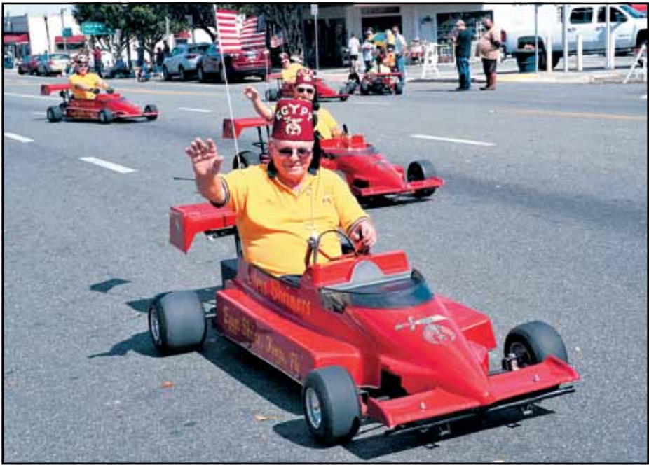
The Egypt Shriners zipped through the streets in their speedy go-karts and jalopies.