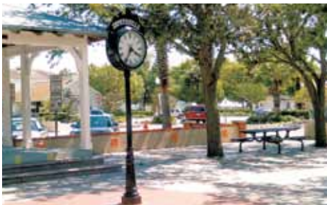
Main Street Zephyrhills