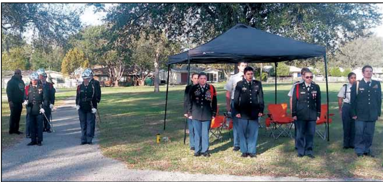
JROTC members wait for the flag retirement ceremony to begin last Friday.