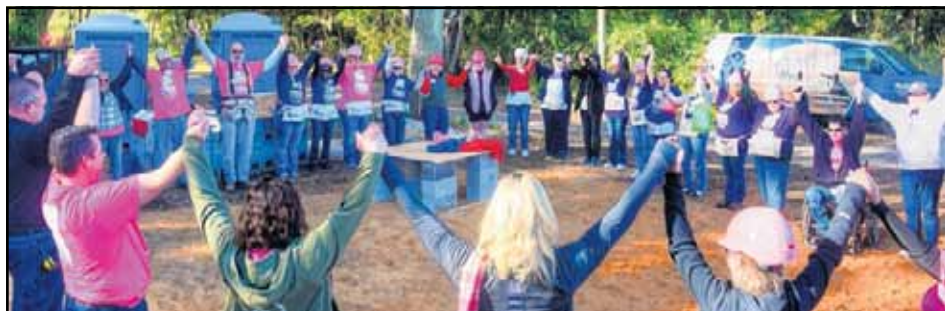
Habitat construction days always begin with a fellowship circle and the phrase, 'Not a Hand Out, but a Hand Up.'

There are only 50 slots available for each day of the build and pre-registration