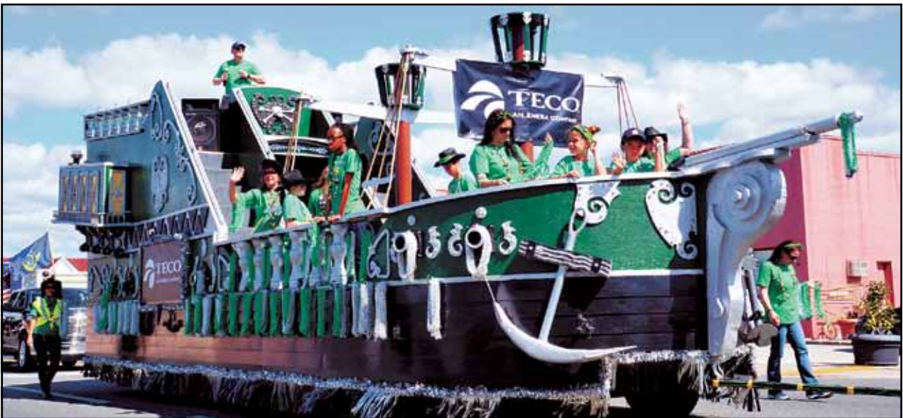
Members of TECO were ready to set sail on their impressively designed vessel.

President’s Day, but school or no school folks demanded the parade return.