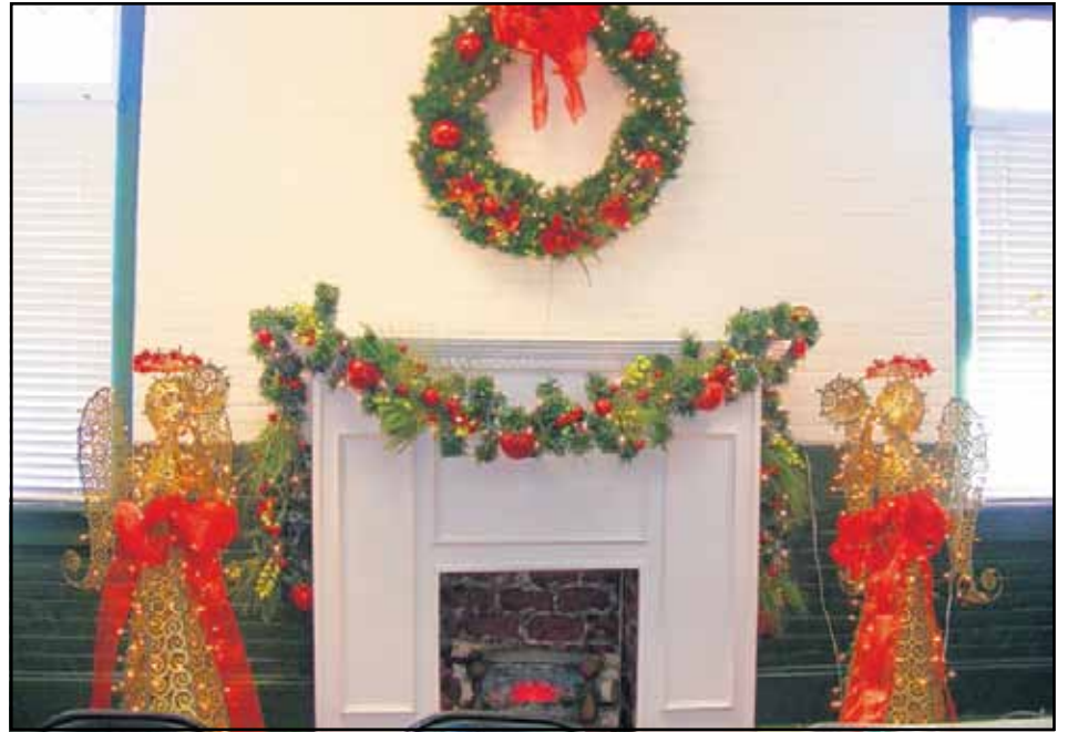
A fresh coat of paint has been applied to this fireplace before it is displayed in City Hall for the holidays.