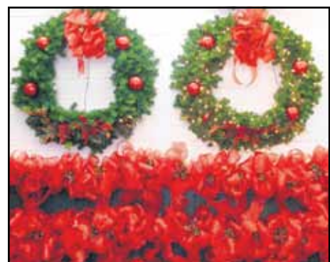
The city owns 25 commercial wreaths used to decorate for the holidays.