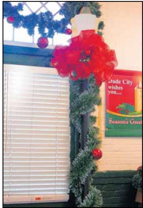
One of the more than 200 poles displayed along Seventh Street.