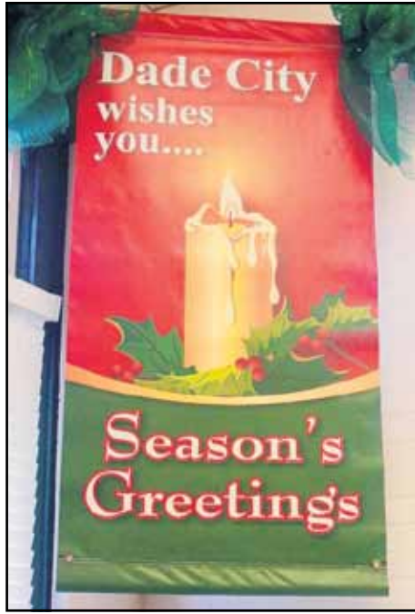
This banner hangs across Meridian Avenue.