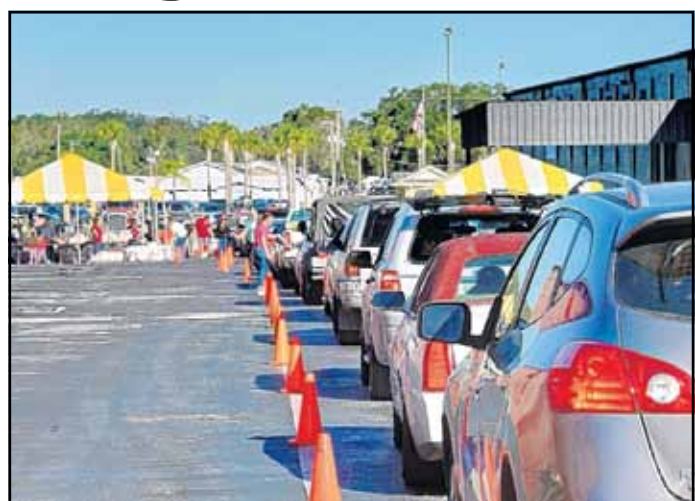
The Holiday Food Giveaway has been helping 'food insecure' people in east Pasco for five years.

Dozens of volunteers including cub scouts, girls scouts, Rotary club members and people who just wanted to help, kept the long queue of cars moving along.