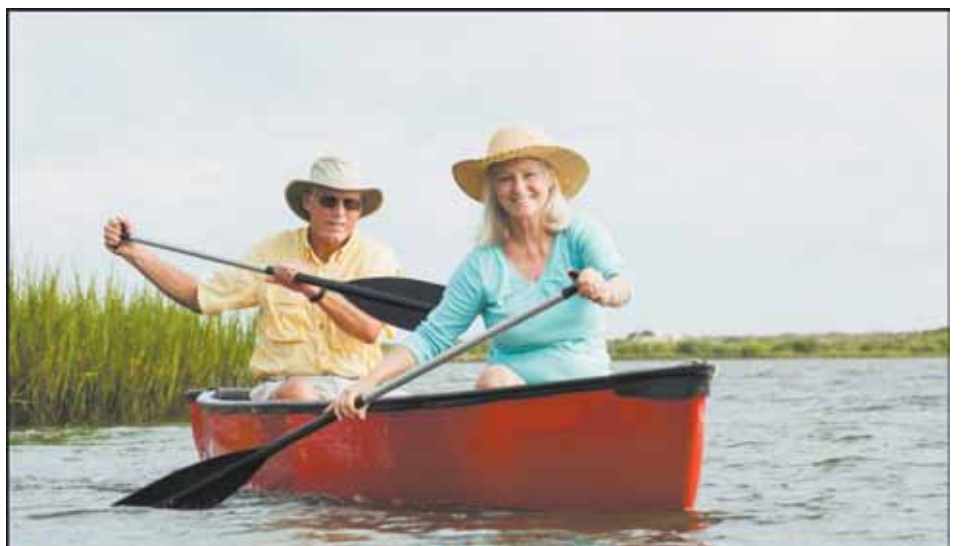
Chart a course to relief from joint pain. Start at our free seminar.

*Medical professionals may include physicians, physician assistants and nurse practitioners.