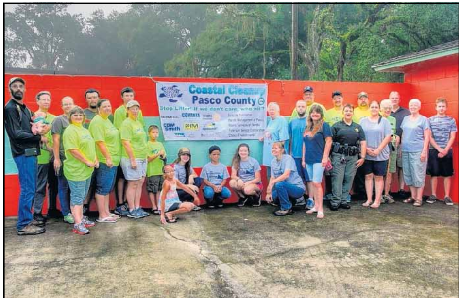
Shown are some of the more than 30 community members and supporters who helped clean up the Trilby and Lacoochee area last week.