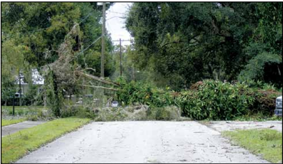
Southview Avenue was blocked north of Eighth Street by a large tree that was uprooted by Hurricane Irma.

police department to the utilities and public works departments really stepped up to help Dade City to continue to be the great place that it is. They were getting it for four days straight. I'm just proud to be associated with the men and women of Dade City," Poe said. Dade City fared better than anticipated because Irma had weakened some before hitting the area. "If it had come in as a Category 2 or a Category 3, as predicted, things would have been a whole lot worse," he said. City Hall was without power until late on the afternoon of Sept. 12, Poe said. Other parts of the city were without power for longer, Poe said. The length of time depended on how long it took for the utility customers servicing the affected customers to restore power. Tenth Street and Whitehouse Avenue experienced flooding from Irma's steady rainfall. The Combined Cycle Cogeneration Plant began pumping water from that area Tuesday after