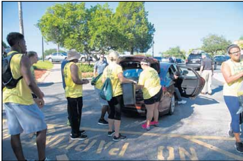
Student volunteers help unload a car for a fellow Lion on move-in day.

The big move-in day begins at 8 a.m., Aug. 17, when new students living on campus are welcomed to their new home away from home. Students and their families will