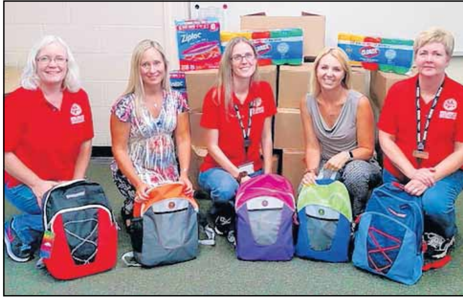
Five of the 50 backpacks donated to Centennial Elementary School through money raised by the Pasco County Tax Collector's Office in Dade City.