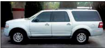
2012 FORD EXPEDITION XLT