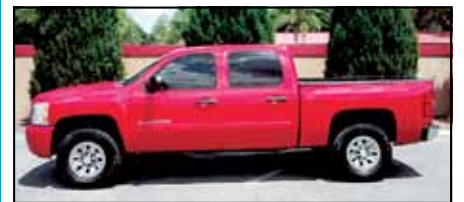
2010 CHEVROLET SILVERADO 1500 LT

CALL FOR DETAILS ON THESE VEHICLES AND MORE!!