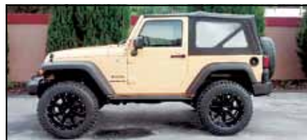
2013 JEEP WRANGLER SPORT