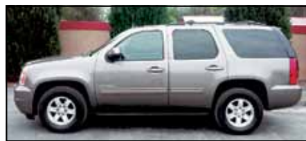
2011 GMC YUKON SLT