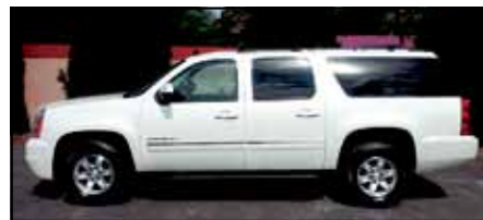
2011 GMC YUKON XL SLT