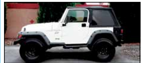
1999 JEEP WRANGLER SPORT