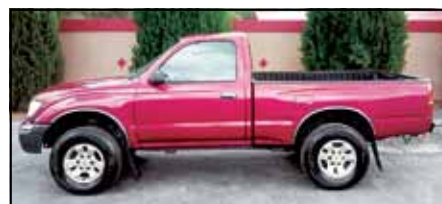
2000 TOYOTA TACOMA PRERUNNER