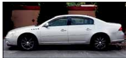
2006 BUICK LUCERNE CXS