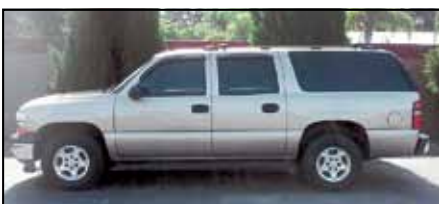
2006 CHEVROLET SUBURBAN LS 1500