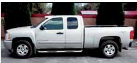
2007 CHEVROLET SILVERADO 1500 LT