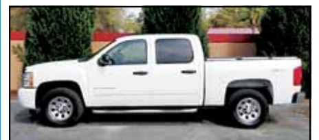
2010 CHEVROLET SILVERADO 1500 LT