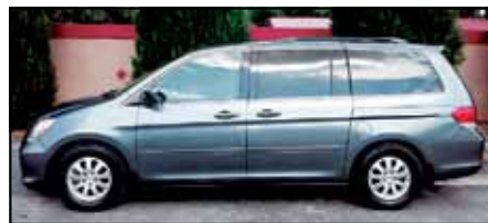
2010 HONDA ODYSSEY EX-L