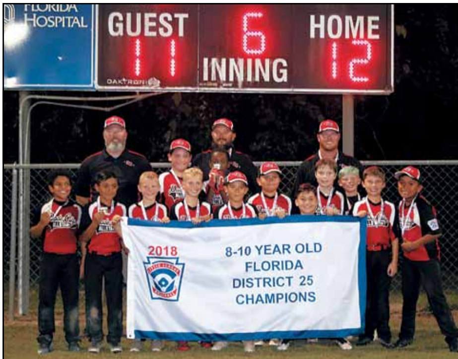
Dade City Little League is the 2018 District 25 8-10-year-old champions following a dramatic 12-11 win against Zephyrhills on Tuesday night.

"Fortunately, we came away with the win."