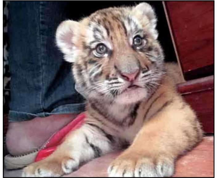
Dade City's Wild Things has been promoting animal encounters with their new tiger cub on their Facebook page.

On June 8, PETA amended its original complaint and now alleges Wild Things is responsible for the death of three newborn tiger cubs a year ago.