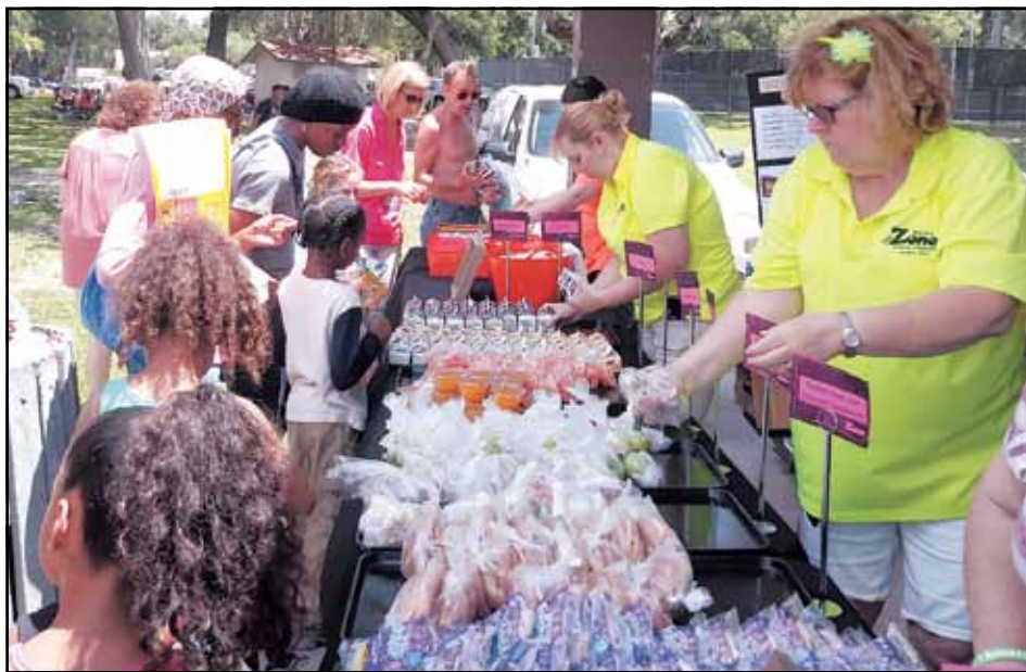
Children line up for meals during the Summer BreakSpot kick off event held at Zephyr Park last Thursday.

party included the Pasco Sheriff's Office, CareerSource Pasco Hernando, Early Learning Coalition of Pasco-Hernando, Premier Community HealthCare, Alliance For Substance Abuse Prevention, the Pasco County Cooperative Extension Office, BayCare Behavioral Health and the Tampa Bay Buccaneers.