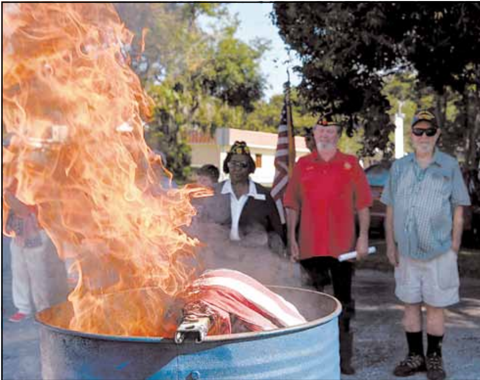
A little more than 200 flags were honorably burned at this year's event.