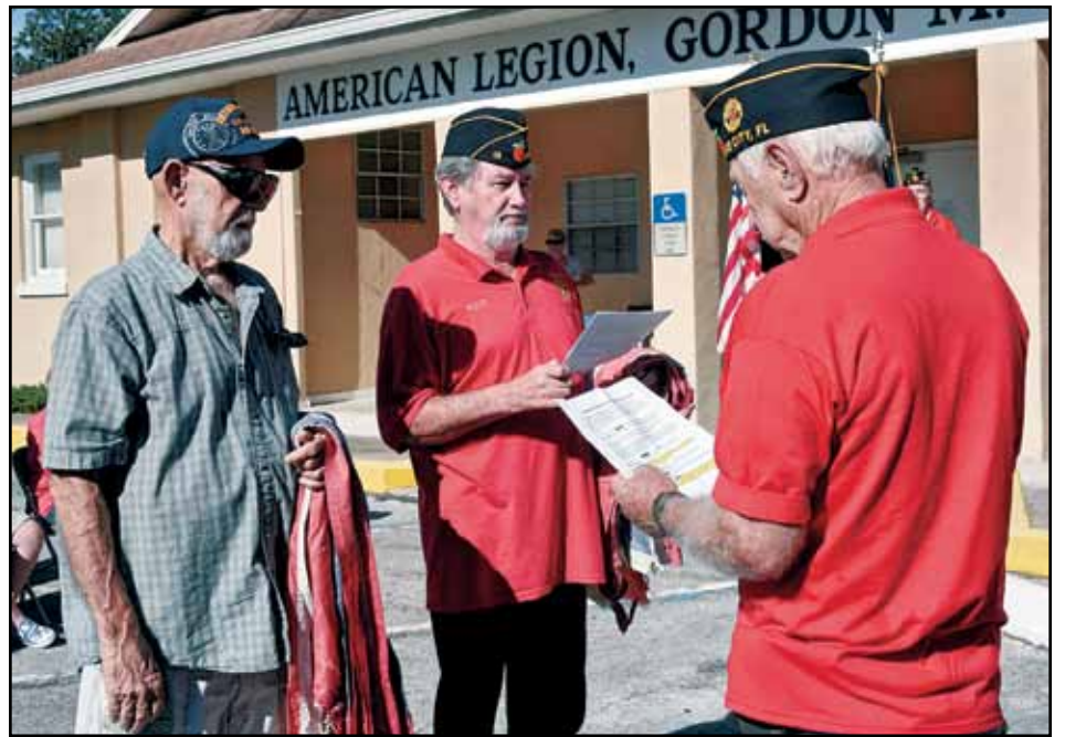
As part of the annual flag retirement ceremony, members of the Dade City American Legion formally inspect the flags that have been turned in for a respectful disposal.