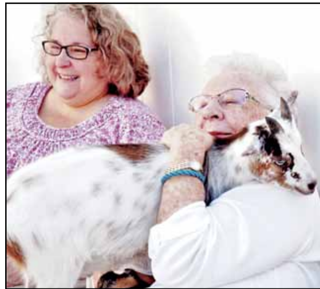
Even those not participating in yoga got the chance to cuddle with the goats.