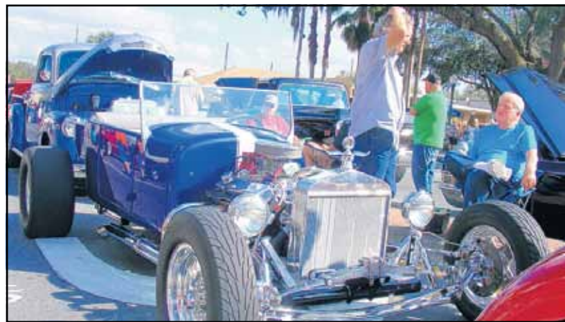
This 1930 Ford Model A pickup has a 350 cubic inch Chevrolet V-8 and four on the floor.

Other vehicles shown included a 1930 Ford Model A pickup with a 350 cubic inch Chevrolet that put out 400 horsepower and was equipped with a four-speed transmission; a black 1970s Ford Ranchero GT; and a green 1930s Ford Model A pickup powered by a 289 cubic inch Cobra V-8.