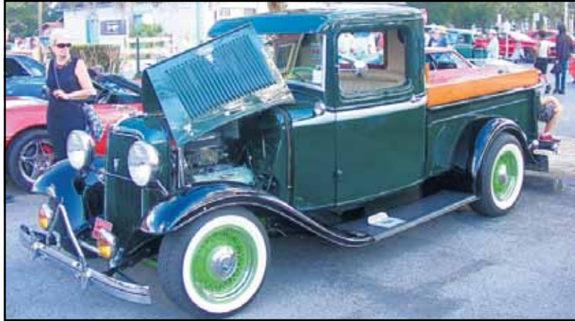
A V-8 powered 1930s Ford Model A pickup was set up for admirers at last Saturday's Cruise In.

A 1934 Dodge pickup truck owned by John Fontana of Floral City was one of the more colorful