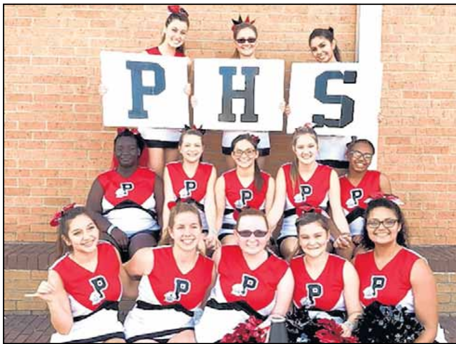
The junior varsity squad at Pasco High School also had a good season, finishing in the top five in several competitions.

The cheerleaders get to take a break for the months of February, March and April. Tryouts are in June, and then they will start over and begin preparing for next year’s competitions.