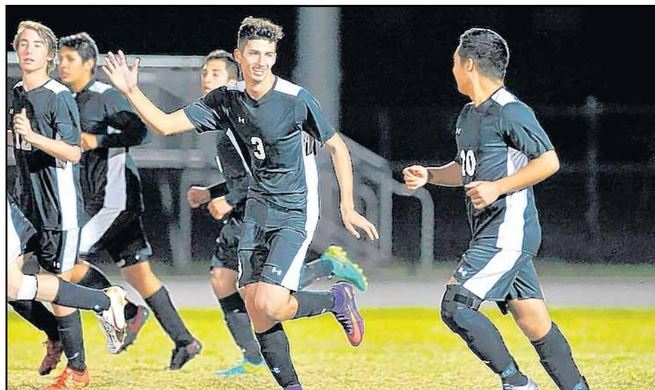
The Pirates celebrate a mid-game victory in the Class 3A region quarterfinal held Feb. 1.