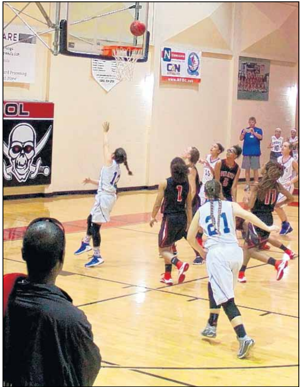
The Anclote Sharks beat the Lady Pirates 41-39 in the Class 6A, District 8 tournament.