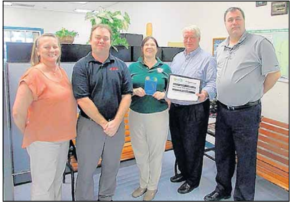
Pasco County Public Transportation staff stand proud with two awards they were recently granted for their successful marketing efforts. Photo Provided

To learn more about Pasco County Public Transportation, including bus routes, transportation news and schedules visit the PCPT website at: http://www.ridepcpt.com .