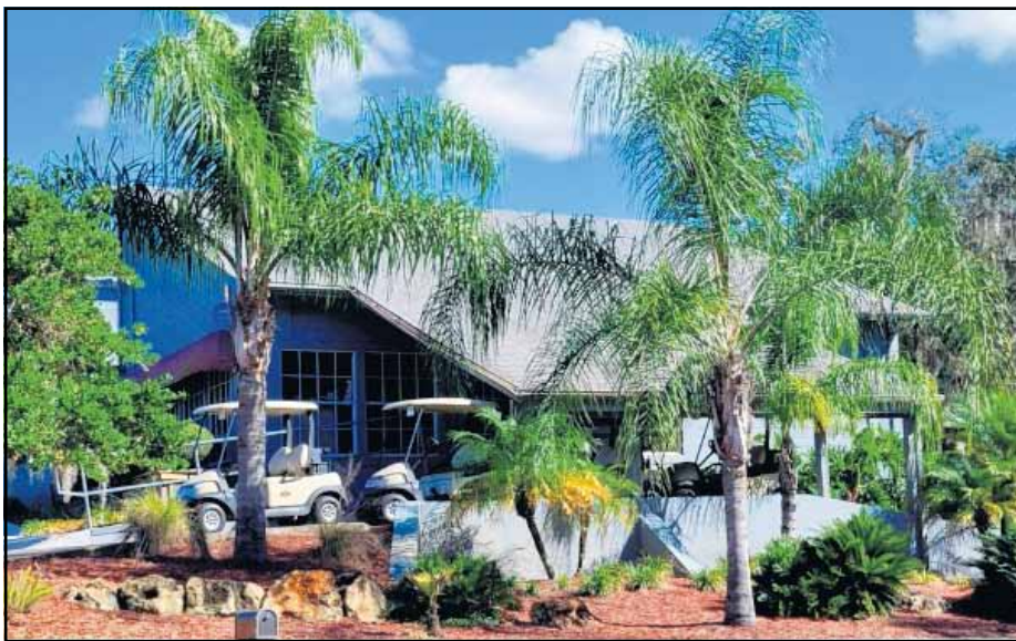
All of the more than 150 RV and mobile home parks in the greater Zephyrhills and Dade City area are invited to sign up a four-person team for the Jan. 30 Battle of the Parks.